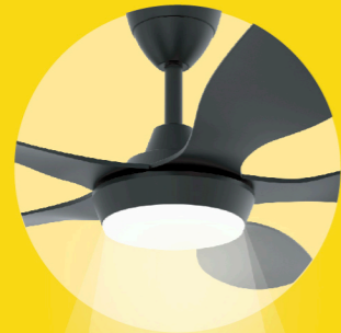
24W, 3 Colour LED Light Kit (LIGHT KIT SOLD SEPARATELY) Model: LK-391681